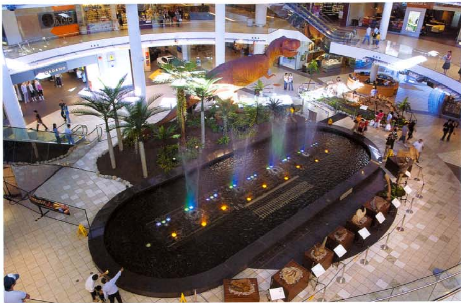
Clockwise from top: Water show at Aberdeen Centre; Richmond City Hall at night; Sierra Wireless' headquarters.