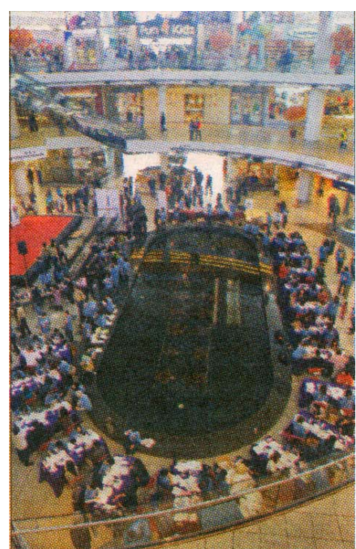
People line up at Richmond's Aberdeen Centre on Saturday for OneMatch's stem cell drive.

Chinese blood cancer patients have a 10 per cent chance of finding a stem cell donor because only two per cent of Canadians signed up with the registry