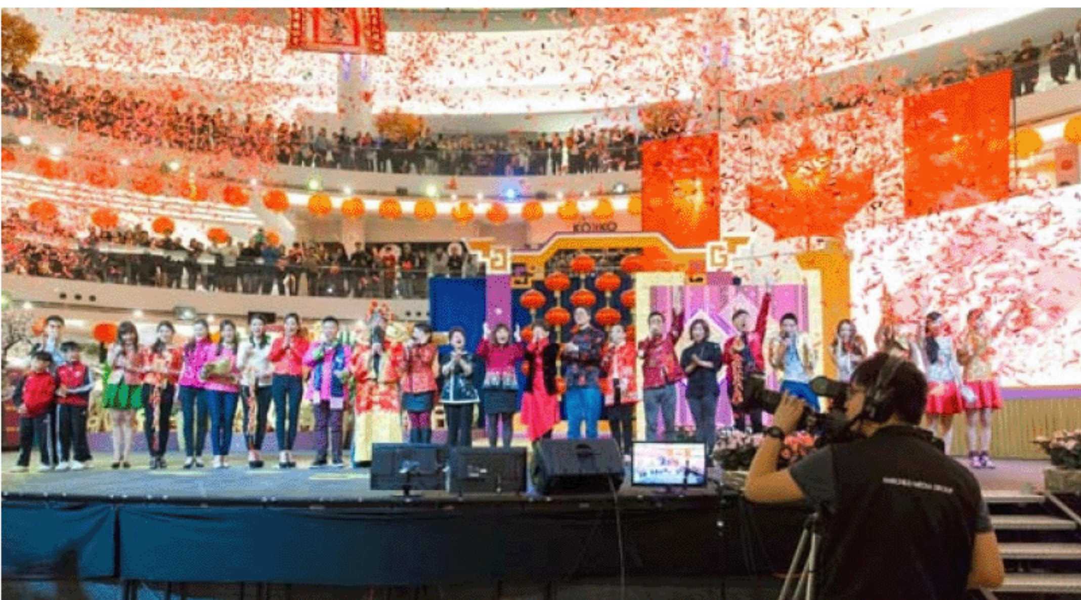
Thousands Chinese tourists celebrate the lunar New Year in Vancouver.

An estimated 1,000 Chinese tourists came to Vancouver for the Lunar New Year, thanks to Destination B.C. launching its Beijing office in October, 2017.