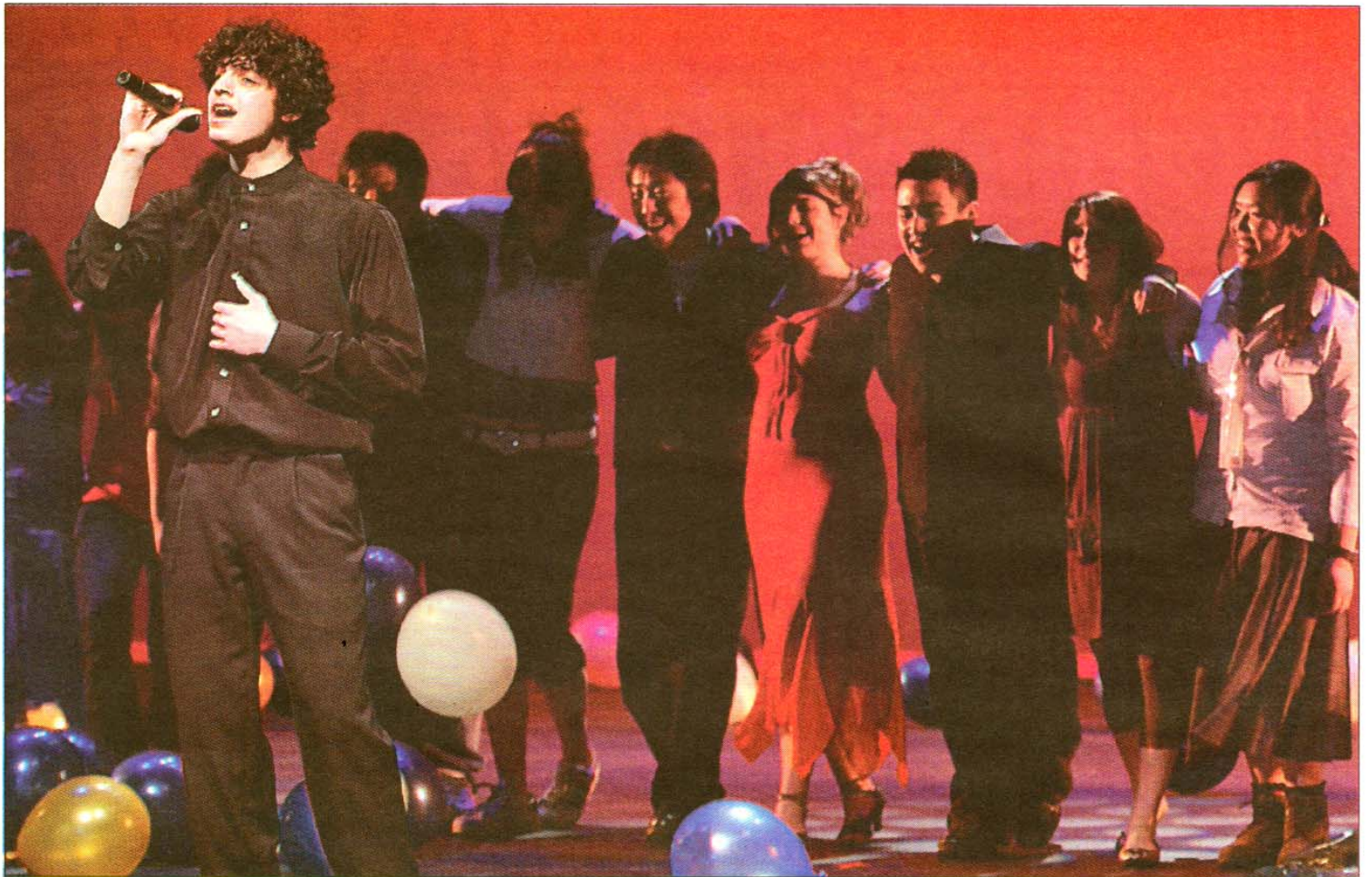
RichCity Idol features top singers from each of Richmond's high schools.

RichCity Idol, the local singing competition among Richmond high school students, is three hours jam-packed with some of the best young voices in the city. Sure, there's the American Idol TV show, but there's no Simon, and aspirations are genuine. Next RichCity Idol is May 29 at Gateway Theatre.